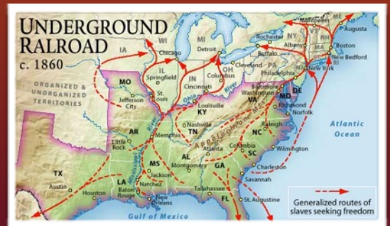
Map of the Underground Railroad