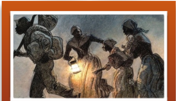
Painting representing slaves escaping at night in the Underground Railroad

Estimates of the number of slaves assisted vary widely, but only a minuscule fraction of those held in bondage ever escaped. Few, particularly from the Lower South, even attempted the arduous journey north. But the idea of organized “outsiders” undermining the institution of slavery angered white southerners, leading to their demands in the 1840s that the Fugitive Slave Laws be strengthened.